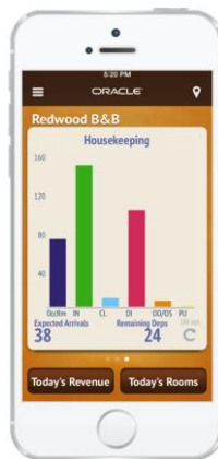
Figure 6. Hotel managers can manage their entire property—viewing information on arrivals, departures, and housekeeping stats, or checking in on F&B operations.