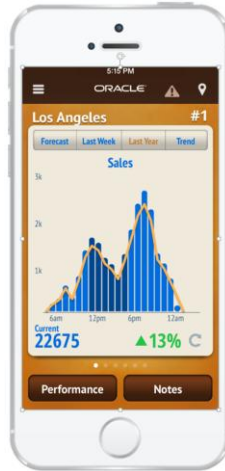
Figure 1. Preview and review real-time forecasts and trends. Capture the day's progress for easy business strategizing.