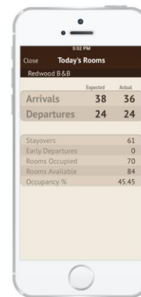
Figure 7. Hotel managers can view real-time information from Oracle Hospitality OPERA Property Cloud Service solutions.