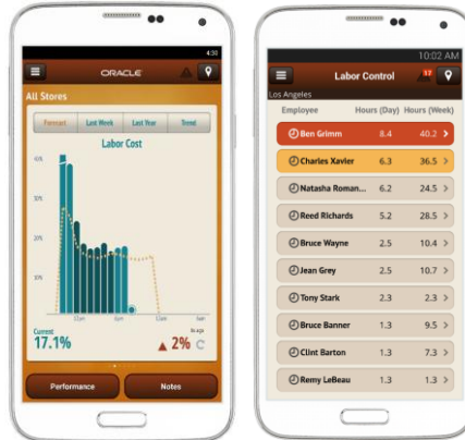
Figure 5. Manage your business from afar. An exception-based alerting system notifies users with relevant information when specified thresholds are exceeded.