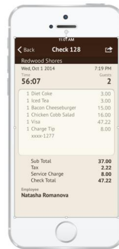
Figure 4. Perform a check lookup and e-mail guests their checks from within the app.